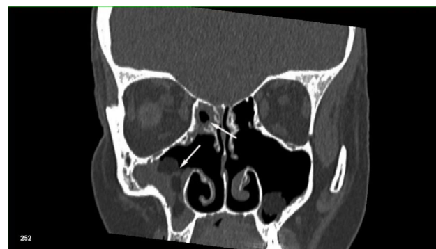
Figure 1 CT scan of the sinuses. Polyposis of the maxillary and ethmoid sinuses (white arrows) in a patient after previous sinus surgery, who underwent allogeneic hematopoietic stem cell transplantation because of primary myelofibrosis.

The majority of reports concerning sinusitis in hematopoietic stem cell transplant recipients have