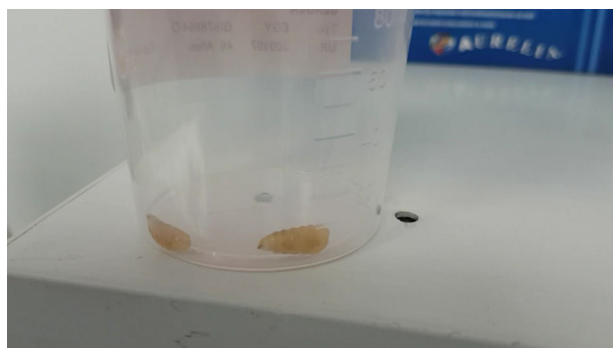
Fig. 2 – Two of the four extracted larvae.

of the lips. She was advised to apply petrolatum jelly to the area. This nodule experienced involution over the next four days. There was no evidence of larval presence in this lesion.