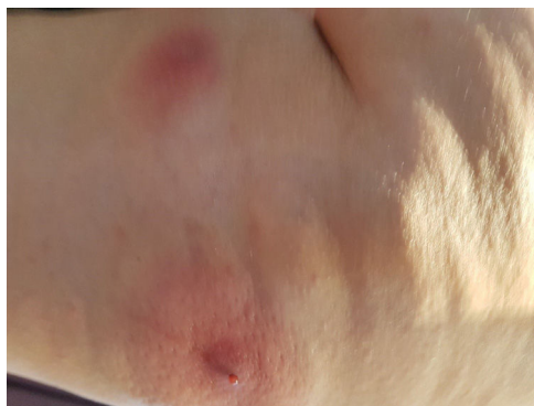
Fig. 1 – Boil-like lesions with serosanguinous secretion.

Two days later, on September 13, she noticed a pale, non-tender nodule on her lower vermilion border on the right side