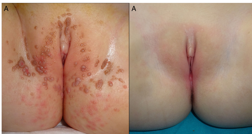
Figure 1 (A) Multiple vestibular and vulvar condyloma acuminata. (B) 13-month follow-up post-CO 2 laser surgery of anogenital condyloma acuminata.

Anogenital CA in the pediatric population is not rare in daily practice as one may suppose. 1,2 However, giant periurethral condyloma occurs exceptionally