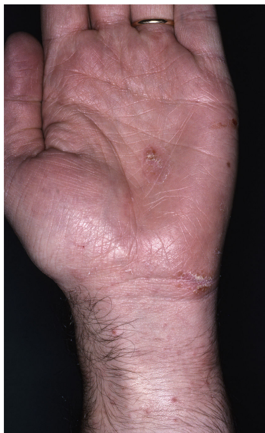
Figure 1 Scabietic burrows and nodules in volar surface of the wrists.

Within twenty-four to seventy-two hours after the administration of oral ivermectin, eleven patients (47.8%) presented new cutaneous lesions that were clinically distinct from those characteristic of scabies. The skin eruptions appeared after receiving the first oral ivermectin dose in 9 patients, after receiving the second dose in 1 patient, and after both the first and second dose in 1 patient. In all of the cases, the eruptions were characterized by itchy, scaly erythematous eczematous plaques located on the trunk and