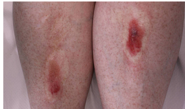
Figure 1 Bilateral atrophic plaques with overlying blisters.

We have also found cases with 2 or more coexisting bullous diseases, such as pemphigus vulgaris, epidermolysis bullosa, and porphyria cutanea tarda; these diseases were ruled out in our patient. 3,10 Likewise, scleroderma-like changes are recognized in