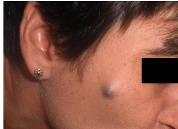
Figure 1 Nodule on the right cheek.

The lesion was completely removed, and histopathology revealed a multinodular skin lesion that was well defined with cellular atypia, mitosis, and areas of necrosis. The lesion was not connected to the follicular epithelium or