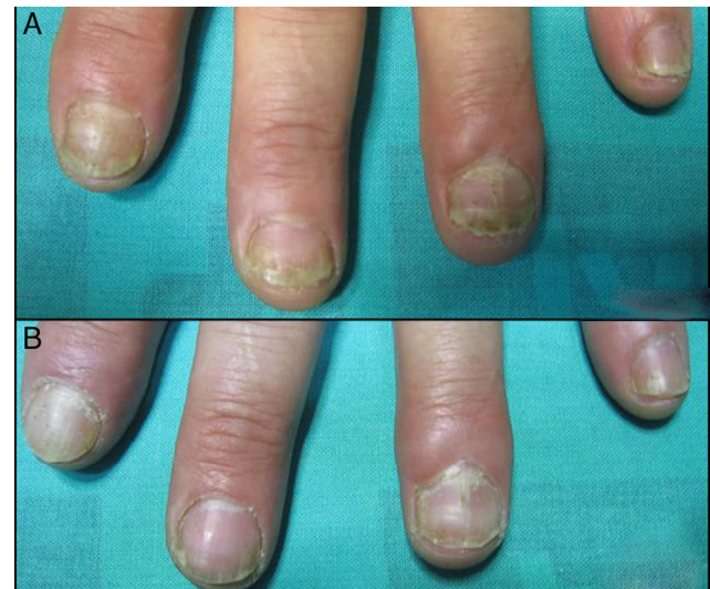
Figure 3 (A) Distal onycholysis, subungueal hyperkeratosis and distal oil drop of nail plate psoriasis of the left hand before the treatment. (B) After four sessions of Nd:YAG.