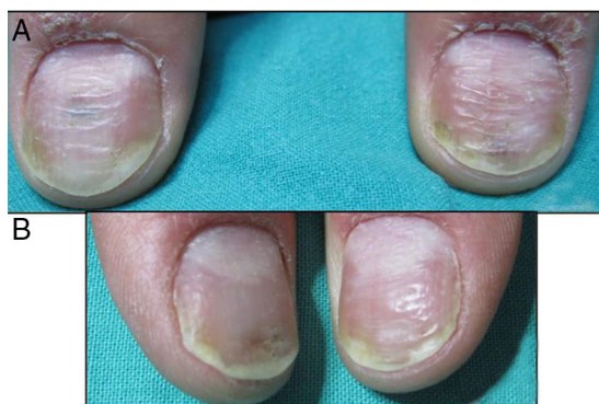
Figure 2 (A) Matrix and bed nail psoriasis before treatment. (B) After four sessions of PDL (right thumbnail) and four sessions of Nd:YAG (left thumbnail).

All patients experience improvement in the global, matrix and nail bed NAPSI score (Figs. 1–4). The pre-treatment global NAPSI mean was 34.85 \pm 13.898 and the post-treatment was 19.38 \pm 12.48 with a diminution of the