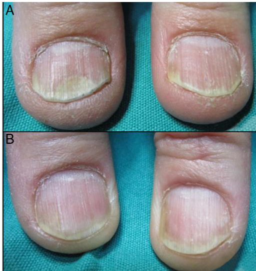
Figure 1 (A) Bilateral Distal onycholysis before treatment. The right thumbnail was treated with PDL while the left thumbnail with Nd:YAG. (B) After four sessions of PDL (right thumbnail) and four sessions of Nd:YAG (left thumbnail).

respectively, none of them due to adverse reactions. The mean age was 48 \pm 15 years and the majority had occupations that required regular use of the hands. Twenty three per cent of the patients (3 patients) had exclusive nail involvement, 31% (4 patients) associated psoriatic arthritis and 38% have not received previous treatment. None of those that have been treated before with topical (corticosteroids, calcipotriol, retinoids, or a combination of these) or systemic therapy (acitretin, methotrexate) have showed previous improvement of their nail involvement.