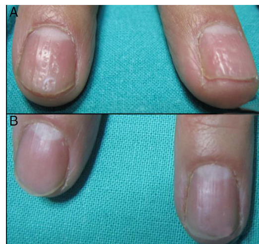
Figure 4 (A) Nail matrix psoriasis of the right hand before treatment. (B) After four sessions of PDL.

global mean of 15.46 ( p < 0.000 ) (Table 1). Unlike other studies, we did not find a significant difference between the drop in the matrix and the nail bed NAPSI score mean.