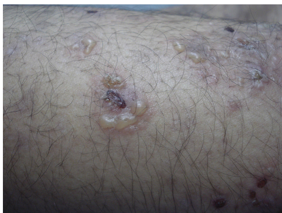
Figure 1 Blisters containing serum arranged in a rosette pattern with a central crust on erythematous skin.

Physical examination revealed blisters containing serum arranged in rosette formation on erythematous plaques and healthy skin, vesicles grouped together in branches (Figs. 1 and 2), erosions, crusts, and excoriations resulting from scratching because of intense pruritus. The lesions were located on the trunk, upper and lower limbs, and gluteal area. The oral and genital mucosa and scalp were spared, and the Nikolsky sign was negative. Her general status was normal.