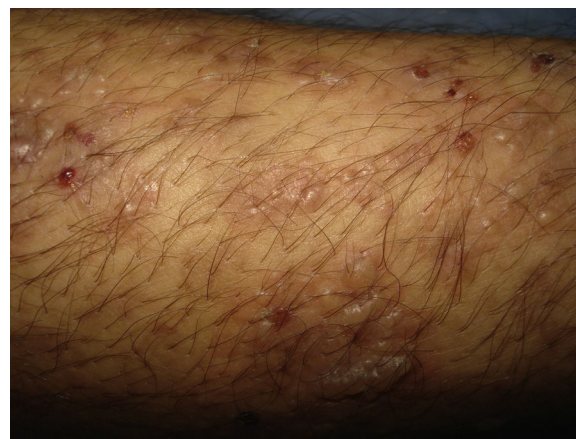
Figure 2 Branching vesicles on healthy and erythematous skin. Crusts and erosions on the right leg.

Treatment was started with methylprednisolone at 1 mg/kg/d, which was subsequently complemented with mycophenolate mofetil. Corticosteroids were tapered until discontinuation. Since the active lesions had resolved after 2 years, treatment was discontinued.