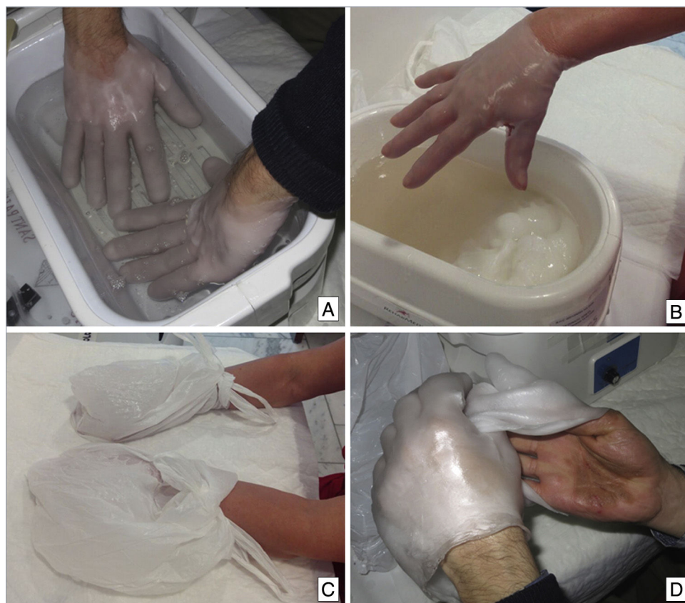
Figure 2 A, Introduction of the hands into the device with the liquid paraffin. B, The hand is removed from the tank and the procedure repeated until the paraffin coats the hand like a glove. C, The hands are inserted into plastic bags for 15 to 20 minutes. D, Remove the paraffin wax.