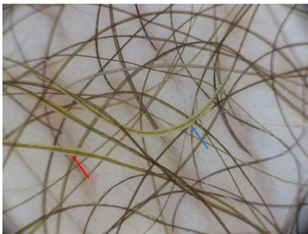
Figure 2 Dermoscopy revealing irregular masses around the hair. The feather sign (red arrow) and the brush sign (blue arrow) are visible.

Dermoscopy is a simple technique for all dermatologists. Initially it was used to study melanocytic lesions, but more recently it has also been used to facilitate the diagnosis of nonmelanocytic lesions and of inflammatory and infectious diseases. The dermoscopic characteristics of dermatoses that affect the hair, such as pediculosis, pseudofolliculitis, and alopecia areata have already been described. 5,6