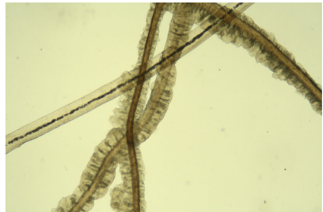
Figure 3 Mucoid sheaths around the hairs. Potassium hydroxide, original magnification x40.

In trichomycosis, dermoscopy reveals yellowish-white masses with a waxy appearance, adherent to the hair. The dermoscopic findings in our patient were similar to previous reports, and some authors have used the term feather sign or brush sign. 7,8 Concretions with the appearance of a rosary of crystalline stones have also been described. 9