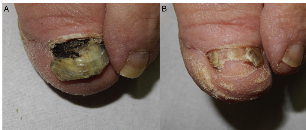
Figure 1 A, Onychoclasia and onychomadesis with dark pigment in the nail bed. B, Partial residual onychia with almost complete disappearance of the pigment.

cream under an occlusive dressing, leading to a progressive clinical improvement. At 5 months the pigmentation had practically disappeared, leaving a residual partial onychia (Fig. 1B); cultures were negative.