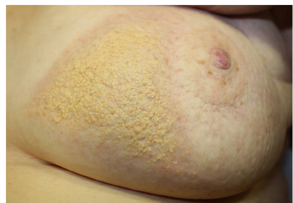
Figure 1 Yellowish plaque with a verrucous, papilliform surface surrounded by an erythematous halo on the left breast.

Despite the few cases published, it has been hypothesized that these xanthomatous cells may be histiocytes that survived the chemotherapy or radiotherapy or histiocytes from peripheral blood that engulf necrotic fat debris released by destroyed tumor cells and become xanthomatous cells. 1,3-5,7,9 It is plausible that chemotactic substances released in response to the tumor necrosis trigger the recruitment of monocytes, which then differentiate into histiocytes. These, in turn, would be activated, increase in size, and trigger the release of more chemokines, leading to the recruitment of additional monocytes and a considerable accumulation of histiocytes in response to the tumor necrosis. 7 This process does not appear to be