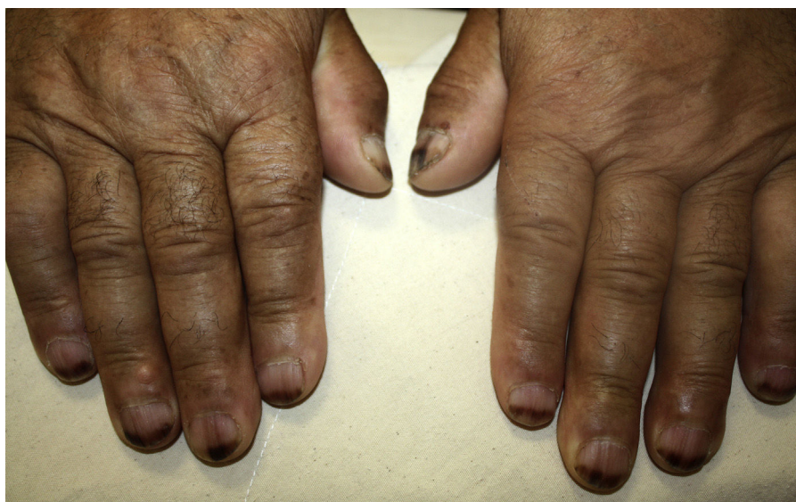
Figure 1 Horizontal melanonychia involving the distal portion of fingernails.

having chronic myeloid leukemia and treated with imatinib 400 mg/day for 3 months. His medical history was not significant except for diabetes mellitus, hypertension and his medications included insulin aspart and ramipril. Examination of the fingernails revealed black-brown discoloration of the distal nail plates (Fig. 1). There was no hyperpigmentation of the toenails, oral mucosa, or skin, and the remainder of the physical examination was normal.