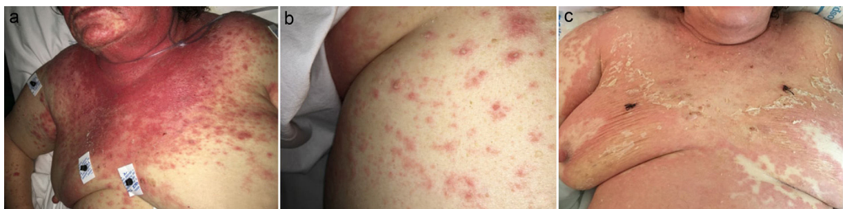
Figure 1 Clinical evolution. (a) Exanthema affecting mainly face, upper trunk, superior limbs with isolated patches on abdomen and lower extremities. (b) Closer image showing isolated pustules surrounded by erythema. (c) Evolution of the exanthema 5 days after Sorafenib discontinuation. Mild erythema and desquamation on upper trunk with pustules resolution.

Laboratory examination revealed a hypereosinophilia of 1.4 \times 10^9/L . A skin biopsy was performed, rendering typical histological features of AGEP (Fig. 2). Attending to the