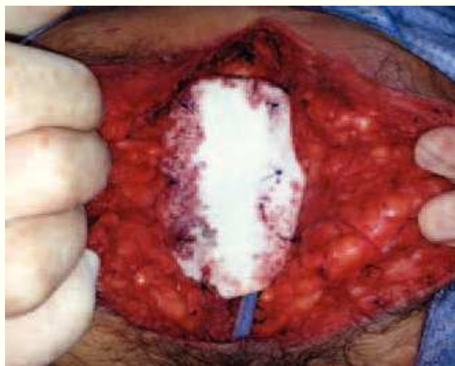
Fig. 7 – Perineal defect repair using a biological mesh after CAPE.

Indications for CAPE are the same of APE: tumors with direct invasion of the anal sphincter, distal rectal lesions in incontinent patients and impossibility to achieve a safe distal margin with a sphincter sparing technique. However, there is still controversy whether CAPE should replace standard APE or should be considered as an alternative approach for selected patients.