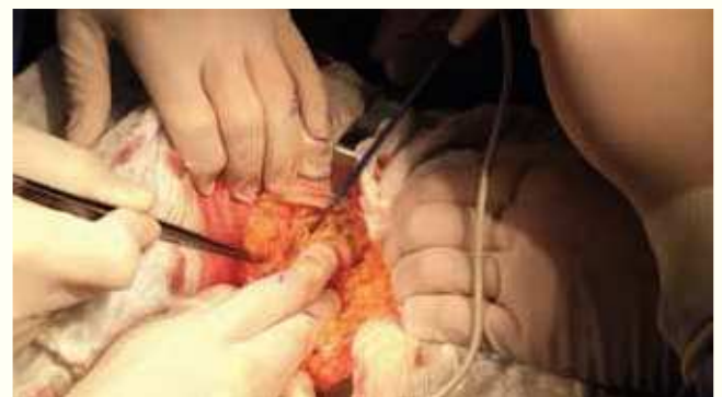
Fig. 4 – Coccygeal dissection and resection.