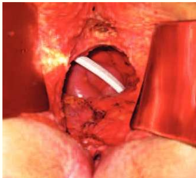
Fig. 6 – Perineal view after CAPE and closure of the posterior vaginal wall.