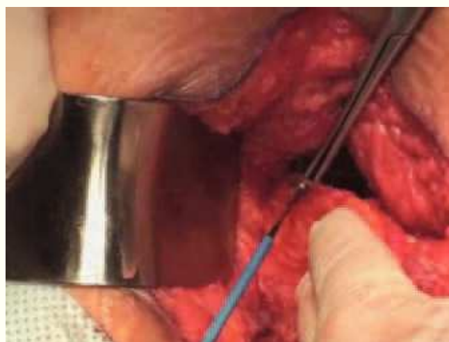
Fig. 5 – Transection of levator muscles under direct visualization.

Final specimen shows no “waisting” at the level of the anorectal ring. Instead, a cuff of extralevator muscles can be seen attached to the rectum (Fig. 8 and 9).