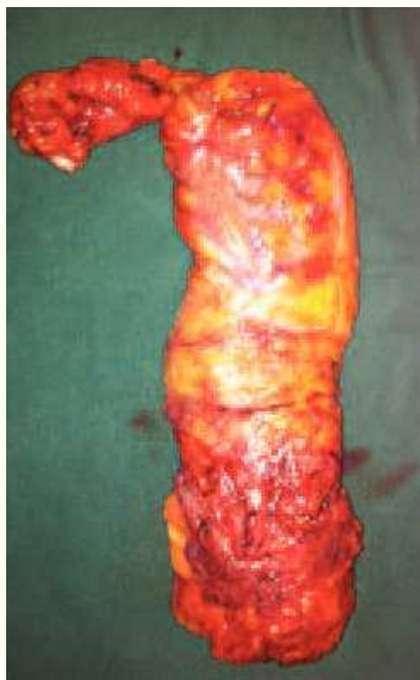
Fig. 8 – Specimen after CAPE with no “waisting” near the anorectal ring.