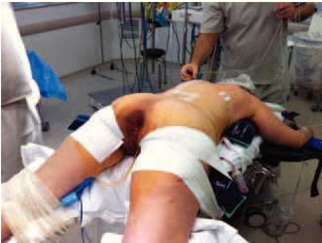
Fig. 1 – Patient in jack-knife position.

Resection of the vagina (Fig. 6) or Denonvillier's fascia is considerably facilitated by the excellent view provided. Finally, the resection is completed with the division of the pelvic diaphragm muscles.