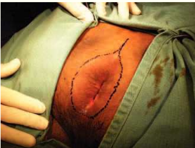
Fig. 2 – Anal closure and planning of the perineal incision.