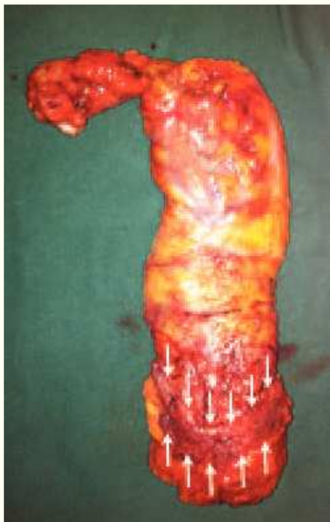
Fig. 9 – Specimen with indication of significant amount of levator muscles attached (white arrows).

The decision of performing a CAPE must be taken preoperatively based on staging information provided by imaging modalities. In this setting, MRI has proven to be efficient in differentiating those tumors amenable to be treated with surgery through excision of the mesorectal plane from those requiring dissection through the “extralevator plane”. 18