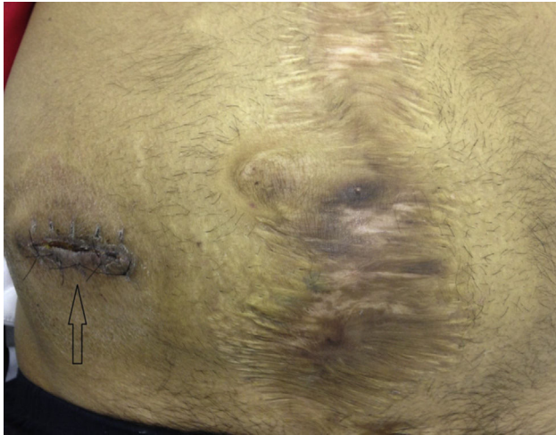
Fig. 3 – Final appearance of the abdomen. Arrow, ITR incision.

incised surgeries are a good choice in some situations, such as in the reconstruction of intestinal transit, as an alternative to videolaparotomy, which present a very varied incidence in the literature with regard to conversion rates in the presence of large numbers of firm intra-abdominal adhesions, as in the case described in this paper. 8