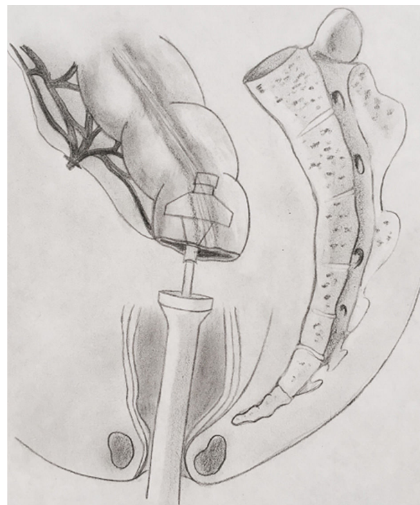
Fig. 2 – End to end colorectal anastomosis.

During this study, sixteen patients underwent isoperistaltic transposition of the right colon remnant with colorectal anastomosis (CRA) or coloanal anastomosis (CAA). In total, 9 (56%) males were included. The median age was 47 years (range 22–76). Eleven patients were included in the DP group (68%). No differences were found between both groups in terms of age, sex, score of the American Society of Anesthesiologists (ASA), body mass index, and the number of comorbidities (Table 1).