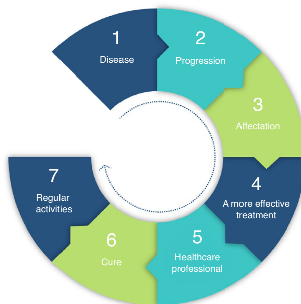
Fig. 2 – Flexible lines.

empirical treatments, which makes it difficult to carry out an event or affectation that can change the flow of these hard lines to flexible or escape lines. 21,22