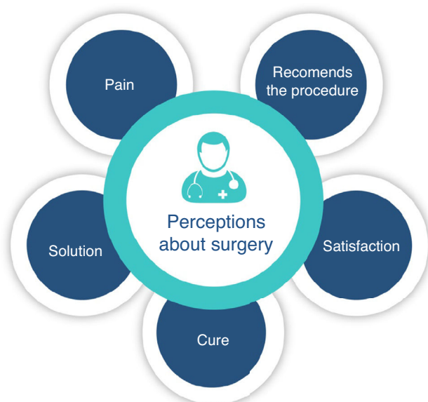
Fig. 5 – Perceptions of the patient about hemorrhoidectomy.

recommend the treatment. It was also observed that, through micropolitics at all levels covered in the health system, this treatment will be announced, and an increasing number of people will have access to it. 19,20