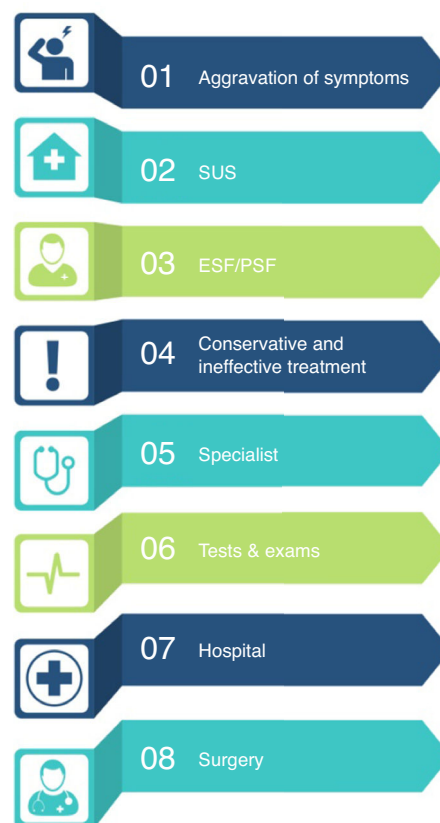
Fig. 4 – Trajectory of patients submitted to hemorrhoidectomy.

"I was lucky because it seems that some person was quitting the procedure; thus, they sent me over, in the place of that person." (E9)