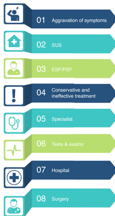
Fig. 4 – Trajectory of patients submitted to hemorrhoidectomy.

"I was lucky because it seems that some person was quitting the procedure; thus, they sent me over, in the place of that person." (E9)