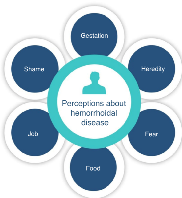
Fig. 3 – Perception of the patient about hemorrhoidal disease.

a limiting cause for achieving a plan of immanence, freeing patients from disease and decreasing its potency. 19,20