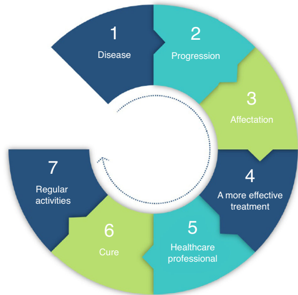
Fig. 2 – Flexible lines.

empirical treatments, which makes it difficult to carry out an event or affectation that can change the flow of these hard lines to flexible or escape lines. 21,22