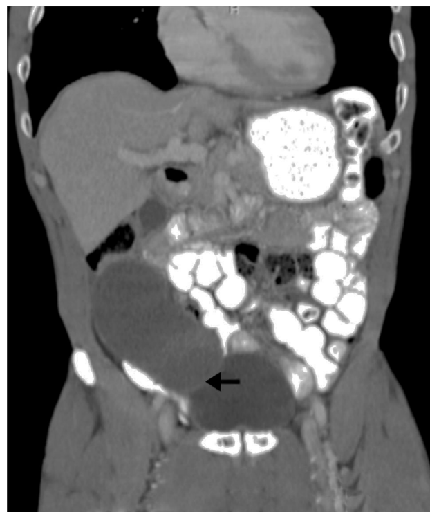
Fig. 3 – Lesion in topography of cecal appendix, hypodense, in a sagittal CT of abdomen (arrow).

Due to the difficulty in distinguishing from cystadenocarcinoma, and the potential complication of rupture (about 20%) and evolution into pseudomyxoma peritonei, the recommended treatment for cystadenoma is surgical, 1,3,4 with