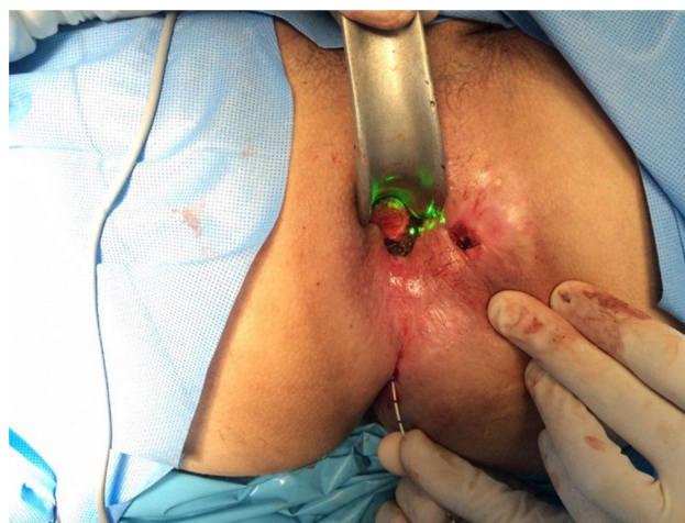
Fig. 2 – Activation of laser fiber.