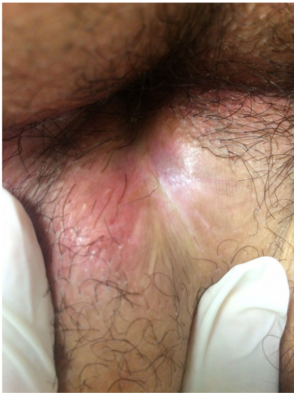
Fig. 5 – Wound healed.