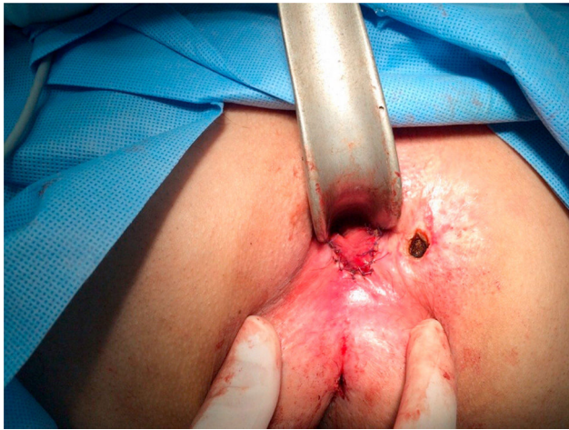
Fig. 4 – Final aspect of procedure.