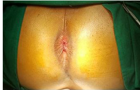
Fig. 1 – Pre-op anal stenosis.

Our patient was diagnosed as severe, diaphragmatic anal stenosis as per the Milson and Mazier classification. 5 Depending upon the anal canal levels, stenosis can be classified as low stenosis (distal anal canal at least 0.5 cm below the dentate