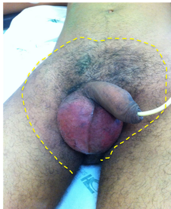
Fig. 1 – Signs of acute scrotum and red skin in the groins and low abdomen suggesting evolution to Fournier Syndrome.

Afterwards, laparotomy was performed and a perforated retrocecal appendix was found with diffuse peritonitis (Fig. 2). Appendectomy was performed and followed by abdominal cavity wash with saline solution.