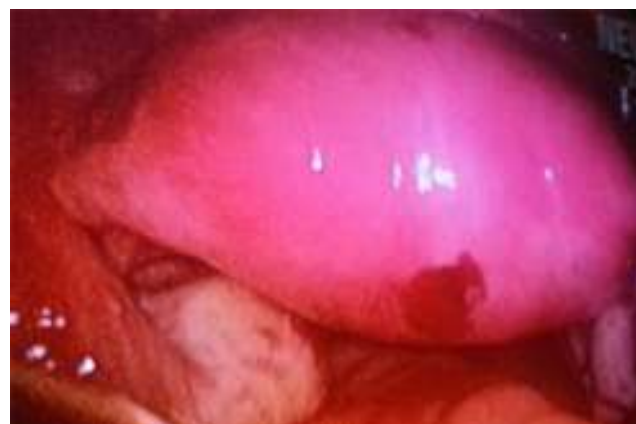
Fig. 4 – Uterine perforation on laparoscopy.

area and inspect the bowel with other organs for diathermy lesions. The postoperative period was smooth and the patient was discharged after 2 days. She was instructed to deliver by elective cesarean section.