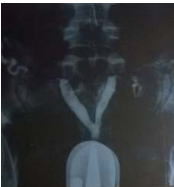
Fig. 1 – HSG showing complete uterine septum.

A 25 year old lady, G0P0, was admitted to Shatby maternity university hospital. She was infertile for 3 years. Her menstrual history was normal. There was no family history of any abnormalities related to uterus. She had done HSG that revealed complete uterine septum (Fig. 1). Ultrasound was performed showing septate uterus with no adnexal masses. Hysteroscopy was performed revealing complete septum extending to the internal cervical os (Fig. 2) that was resected (Fig. 3) by 90 degree needle electrode till both tubal ostia were visible at same plane but uneventfully uterine perforation (Fig. 4) occurred, so laparoscopy was done to cauterize the perforation