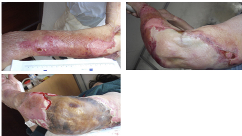
Figure 1. Evolution of skin lesions at first five days of internment: áreas of extensive skin detachment in the context of ruptura of blisters and severe exudation and necrotic áreas.

metacarpophalangeal, interphalangeal and wrist joints. Left upper limb presented diffusely oedematous with a slight erythematous rash and increased temperature. Laboratory tests were as follow: hemoglobin 12.3 g/dl; white blood cell (WBC) count 11.8 \times 10^9/l