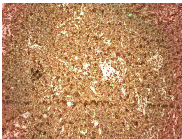
Fig. 2. Biopsy of low grade B-cell lymphoma of MALT type of the parotid gland. CD 20 stain showing sheets of B cells in case 2.

A 16-year-old boy presented with intermittent painless cervical lymphadenopathy and bilateral parotid swelling for more than 5 years. Neck CT demonstrated enlargement of the parotids. A fine needle aspiration showed a benign lymphoid tissue with no evidence of malignancy. Laboratory data showed an increased ESR (122 mm/h). Histopathology analysis showed infiltration of the salivary gland by a lymphocytic proliferation forming confluent nodular masses and follicular hyperplasia of the attached lymph nodes, indicative of a lymphoid malignancy (Fig. 1). Immunohistochemical stains demonstrated sheets of CD20+ B cells that were negative for CD5, CD43, and cyclin-D1, confirming B-cell clonal proliferation (Fig. 2). CD10 and BCL-6 stains highlighted germinal centers which were negative for BCL-2. A Ki-67 stain showed numerous positive cells within and between germinal centers (20–30% cells). Parotidectomy and radiotherapy was performed.