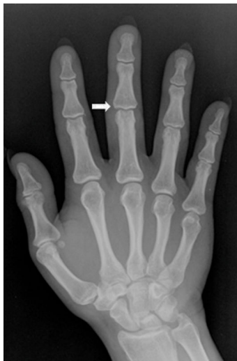
Fig. 3. Anteroposterior radiograph at 2 months follow-up demonstrating resolution of the calcified lesion (arrow).

patients are most commonly women with an average age of 45 years old (range 30–60), otherwise healthy. 3,4