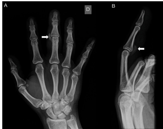
Fig. 1. Anteroposterior (Panel A) and lateral (Panel B) radiographs showing well-circumscribed calcification over the radial and volar aspect of the right third finger proximal interphalangeal joint (arrows).

Three weeks later, the patient experienced complete resolution of swelling and pain and exhibited full range of motion. Follow-up radiographs after two months showed complete disappearance of the calcification (Fig. 3).