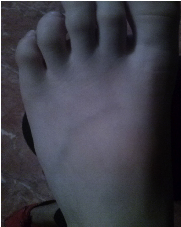
Fig. 1. Skin pallor during an episode.

known allergies. At the age of 2 months, he had been hospitalized for acute otitis media. He was up to date with the immunization schedule of his Spanish autonomous community.