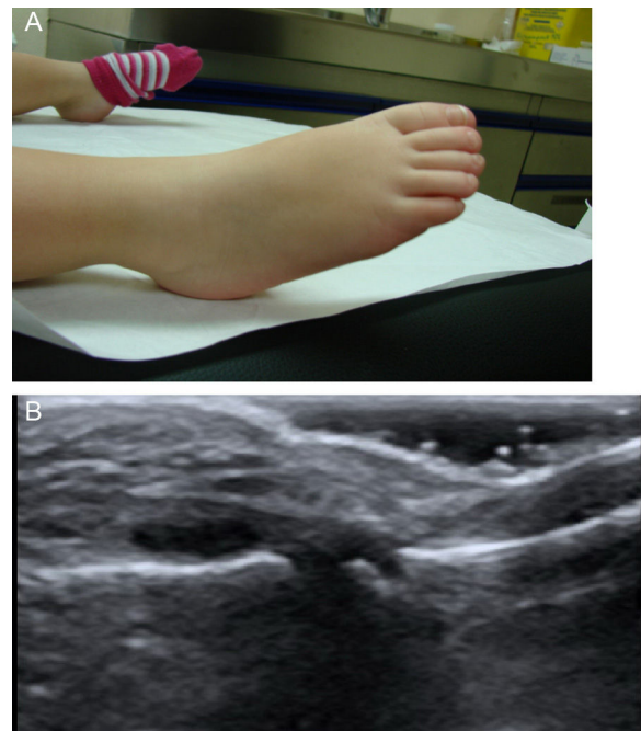
Fig. 1. (A) Arthritis in proximal interphalangeal (PIP) joint of right foot. (B) Ancillary ultrasound examination of PIP joint of right foot.

The presence of joint involvement was detected in only 7 of the 42 children (16%). Oligoarticular disease was predominant (57%), affecting lower limbs, knees and, especially, ankles. The next most common type was monoarticular involvement of the hip (29%), and the ultrasound study accompanying the history showed the presence of distension of the joint capsule due to effusion with no synovial hypertrophy or associated Doppler signal. Finally, only 1 patient (14%) had polyarticular disease, especially in ankles, knees, hands and proximal interphalangeal joint of right foot (Fig. 1). Ultrasound of large joints showed capsular distension provoked by effusion, with no synovial hypertrophy or Doppler signal and accompanied by severe periarticular involvement.