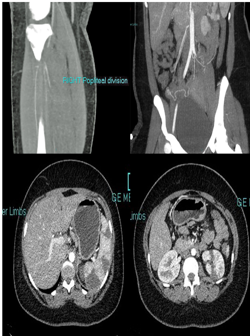
Fig. 1. Extensive fresh thrombus is noted in the left inflow, left CFA and the left SFA. Thrombus also noted in the right internal iliac, right profunda and SFA origin. Fresh thrombus noted in the right distal popliteal and trifurcation origin. Multiple splenic and left renal infarcts noted.

6 weeks ago, at 36 weeks with positive lupus anticoagulant. Recent admission to Hospital due to abdominal pain, seen by Medical and Surgical team that ruled out acute pathology and was referred to Obstetrics service that discharged the patient with further follow-up. At arrival the patient was agitated and uncooperative complaining of abdominal and left thigh pain. The patient reported severe pain in her left leg accompanied by nausea, she did not have chest pain, shortness of breath, fever, chills, dysuria, constipation, or diarrhoea. The temperature was 37.1 °C, the pulse was 91, and the respiratory rate 18. The blood pressure was 135/85 mmHg. The patient was intermittently agitated. Examination revealed diffusely tender abdomen but not distended; the bowel sounds were normal. Examination of the extremities demonstrated absent pedal pulses on both sides, and a mild sensory loss on the left leg. Morphine sulphate, paracetamol and fluids were administered. A point-of-care ultrasound of lower legs showed the absence of a flow signal suggestive of vascular occlusion.