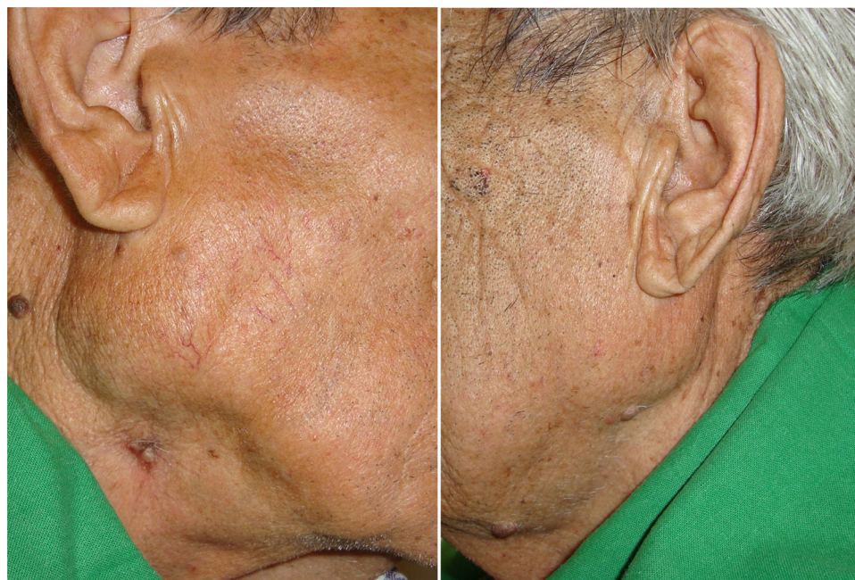
Figure 3 Pictures obtained after treatment was completed (10 month). The parotid gland swelling reduced on both sides and the ulcerative lesion on the right side healed.

technique to differentiate both types of pathologies. Histological and microbiological tests must be run on the tissue sample. Histology testing often shows granulomatous inflammation, while the microbiological diagnosis could be achieved by acid-fast bacilli staining, mycobacterial culture or PCR-based assays. Unfortunately, cultures result negative in 40.9% 3 of cases, due to the control of bacillary replication by an immunocompetent host against an attenuated mycobacteria strain. A CT scan may be a helpful tool in achieving the complete diagnosis as it helps determine the extension of the disease and it is used in the follow-up to evaluate the response to the treatment. 2