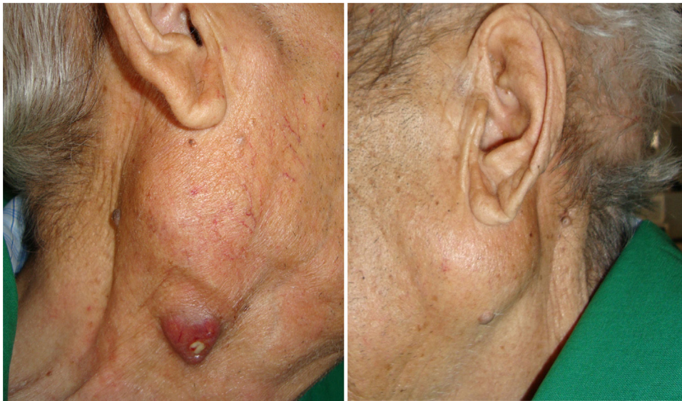
Figure 1 Bilateral swelling of the parotid glands. The right parotid gland shows a small, painless ulcer with continuous pus discharge.