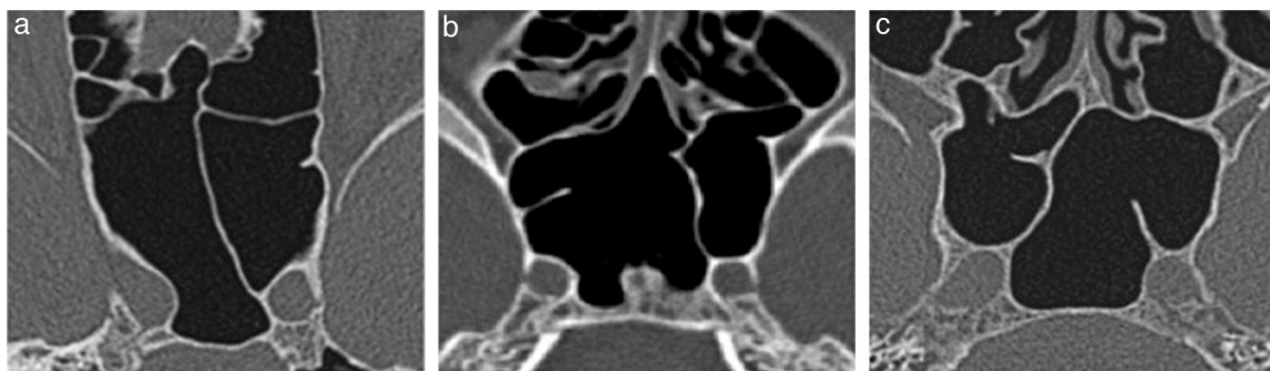
Figure 2 Septation type definition and its relationship with the internal carotid artery protuberance (ICAp). Axial reformatted images obtained from CT data scanning. (a) Intersphenoid septation in the left ICAp. (b) Intersphenoid septation in the left ICAp and an accessory septation in the left sinus wall. (c) Intersphenoid septation in the right ICAp and an accessory septation in the left ICAp.

Sphenoid sinuses were classified based on their degree of pneumatisation, which was established by the spatial relationship of the sinus posterior wall and the anterior and posterior walls of the sella turcica. Sinuses were classified as follows: those with an absence of aeration or minimal aeration were classified as type 1; those with their posterior wall in a position rostral to the sella anterior wall were classified as type 2; those with their posterior wall between the sella anterior and posterior walls were classified as type 3; those with their posterior wall reaching the posterior wall of the