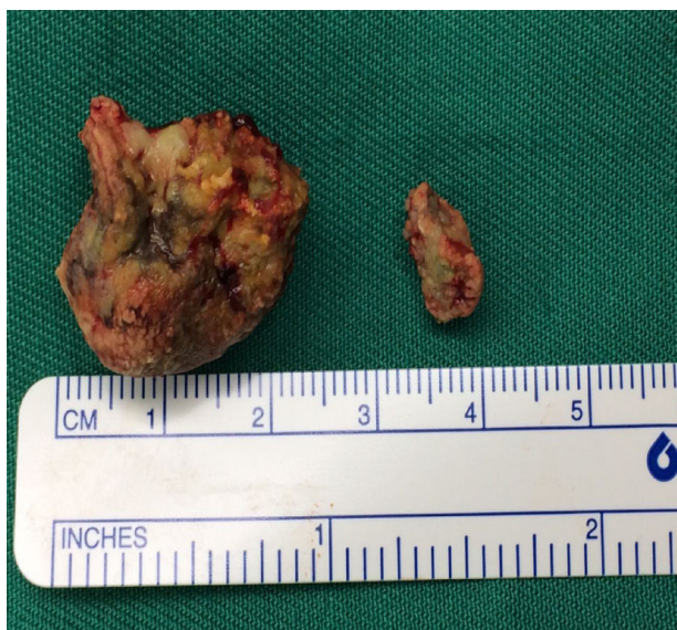
Figure 2 The larger round stone originated from the right peritonsillar space while the smaller oval stone was found at the upper pole of right tonsil.

Intraoperatively, upon dissecting the oropharyngeal mass, we found a large stone measuring 2.5 cm × 2.3 cm, well-concealed by a thin layer of soft tissue (Fig. 2). The stone was tracked upwards into the right peritonsillar space. A smaller stone of 1.0 cm × 0.4 cm was removed from the crypta magna of right tonsil. Tonsillectomy was