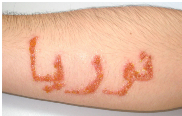
Figure 1 Allergic contact dermatitis caused by PPD from a black henna tattoo in an adolescent aged 16 years. The patient developed a vesicular rash with scab formation delineating the application of henna for the tattoo.

The aim of this study was to determine the prevalence of sensitisation to PPD in the population of paediatric patients referred to a skin allergy clinic, its epidemiological characteristics, and its association with black henna tattoos.