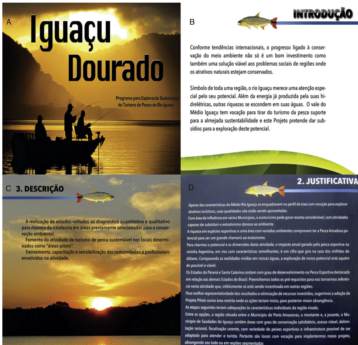
Fig. 2. Publicity material of project for the sustainable exploitation of sport fishing tourism in the Iguazu River basin, entitled 'Iguaçu Dourado': cover material (A), project introduction (B), description of the proposal for the development of sport fishing in the basin (C) and justification for the project (D). Text translation into English is in Supplementary Material.

the existence of specific legislation (Vitule, 2009; Azevedo-Santos et al., 2015). What is needed is a change in the behavior of the population through education and information, the most effective way to mitigate the deliberate introductions of non-native species (Azevedo-Santos et al., 2015). Additionally, the media in general, and more specifically TV shows and magazines about sport fishing, should act as channels of information concerning which species are not native to a region, and be aimed at informing and educating fishermen, so that they can become active partners in combating the invasion of non-native species (Vitule, 2009).