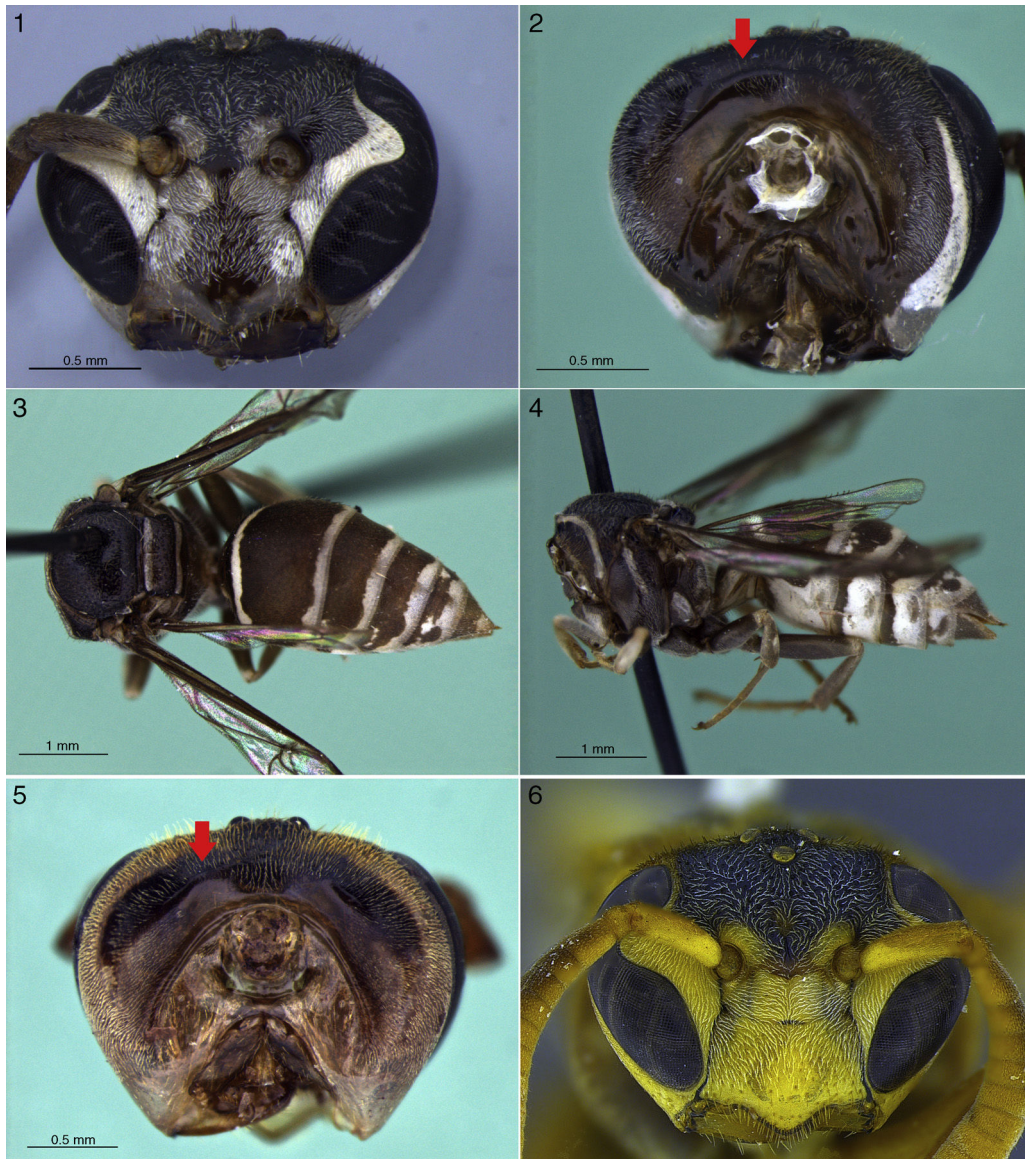
Figs. 1–4. Nectarinella manauara sp. nov. (1) Head, anterior view; (2) posterior view, red arrow points to vestigial occipital carina; (3) mesosoma, dorsal view; (4) lateral view; (5) head of N. championi , posterior view, red arrow points to vestigial occipital carina; (6) head of paratype of N. xavantinensis , anterior view; approximately same scale as (5).

Holotype: female, Brazil, Amazonas, Manaus, Reserva Ducke, 24.ix.1981, J. A. Rafael (INPA).