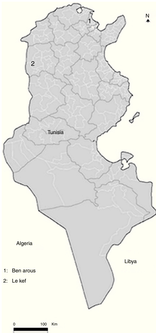
Fig. 1. Geographic origin of Tunisian populations of Anopheles labranchiae .