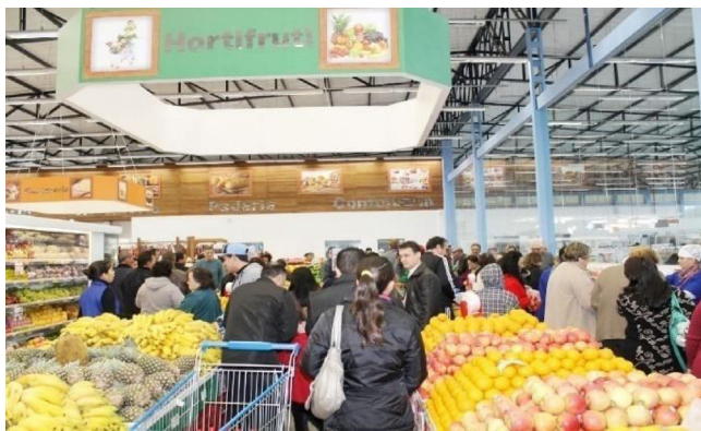
Fig. 2. Stimulus with high human density.

variation of individual emotional responses and of the respondents' perception.