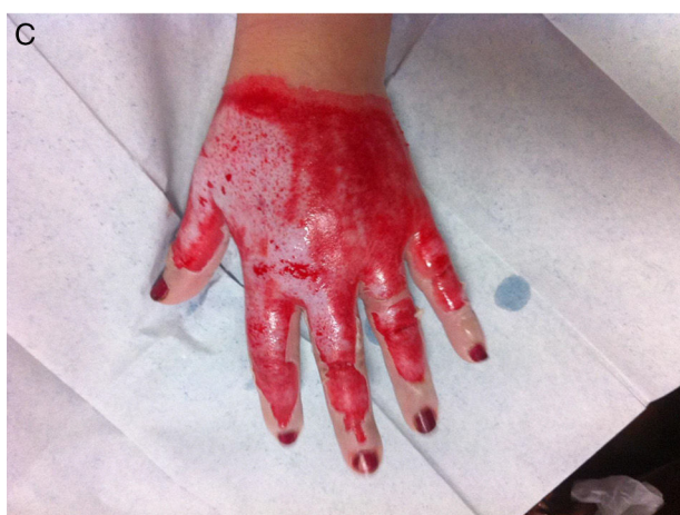
Figure 1 (A) Female 44 years. Flame burn in left hand. (B) Nexobrid being applied 24h post burn. (C) Four hours after enzymatic debridement. No surgical procedure was needed.

during the acute phase of burn resuscitation in the first 48 h after injury. As the interstitial pressure rises there is initially impairment of venous outflow followed by diminution of arterial inflow. This condition will cause dysfunction, ischemia, or necrosis within or distal to that body structure, often within hours. In the limbs, nerve and muscle death may occur causing permanent functional impairment or even the need for amputation. In the abdomen, the impaired blood supply to the bowels, kidneys and other internal organs results in the rapid onset of hepatic and renal failure, intestinal ischemia, and restriction of diaphragmatic excursion.