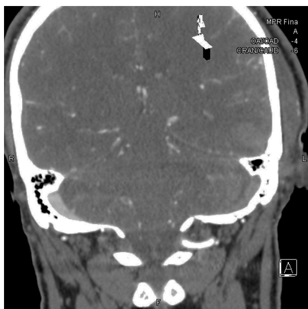
Figure 2 Coronal CT reconstruction: posttraumatic thrombosis in the left transverse sinus.

Patients with spontaneous thrombosis of the sinuses and with no contraindications to anticoagulation should receive low molecular weight heparin or unfractionated heparin via the intravenous route in order to double the activate partial thromboplastin time and arrest the thrombotic process. 5 At present, anticoagulation with low molecular weight heparin is advised, since it is more stable and no adjustment of the coagulation times is required. General antiedema measures should be added to anticoagulation: raising of the patient headrest, recording of mean arterial pressures in order to maintain a cerebral perfusion pressure of >70 mmHg, normothermia, and the avoidance of solutions containing dextrose.