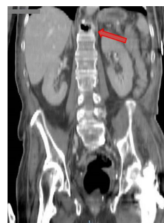
Fig. 2 Sagittal CT scan of the abdomen.

Sixty-two year-old-patient with clinical manifestations of asthenia, low-grade fever, and lower back pain of one month's duration who is hospitalized due to arterial hypotension and oligoanuria. The blood tests show severe metabolic acidosis and acute renal failure. The CT scan of the abdomen shows multiple air bubbles located in the upper retroperitoneum that seemed to come from the disc spaces at D10–D11 levels (Figs. 1 and 2). The patient's progression is fatal with the result of death. The retropneumoperitoneum is a rare radiologic finding with nonspecific, dormant clinical symptomatology. Spondylodiscitis is also a rare type of infection that affects the vertebral body and the intervertebral disc spaces. An early diagnosis is essential to be able to administer the right treatment and improve the prognosis of this disease.